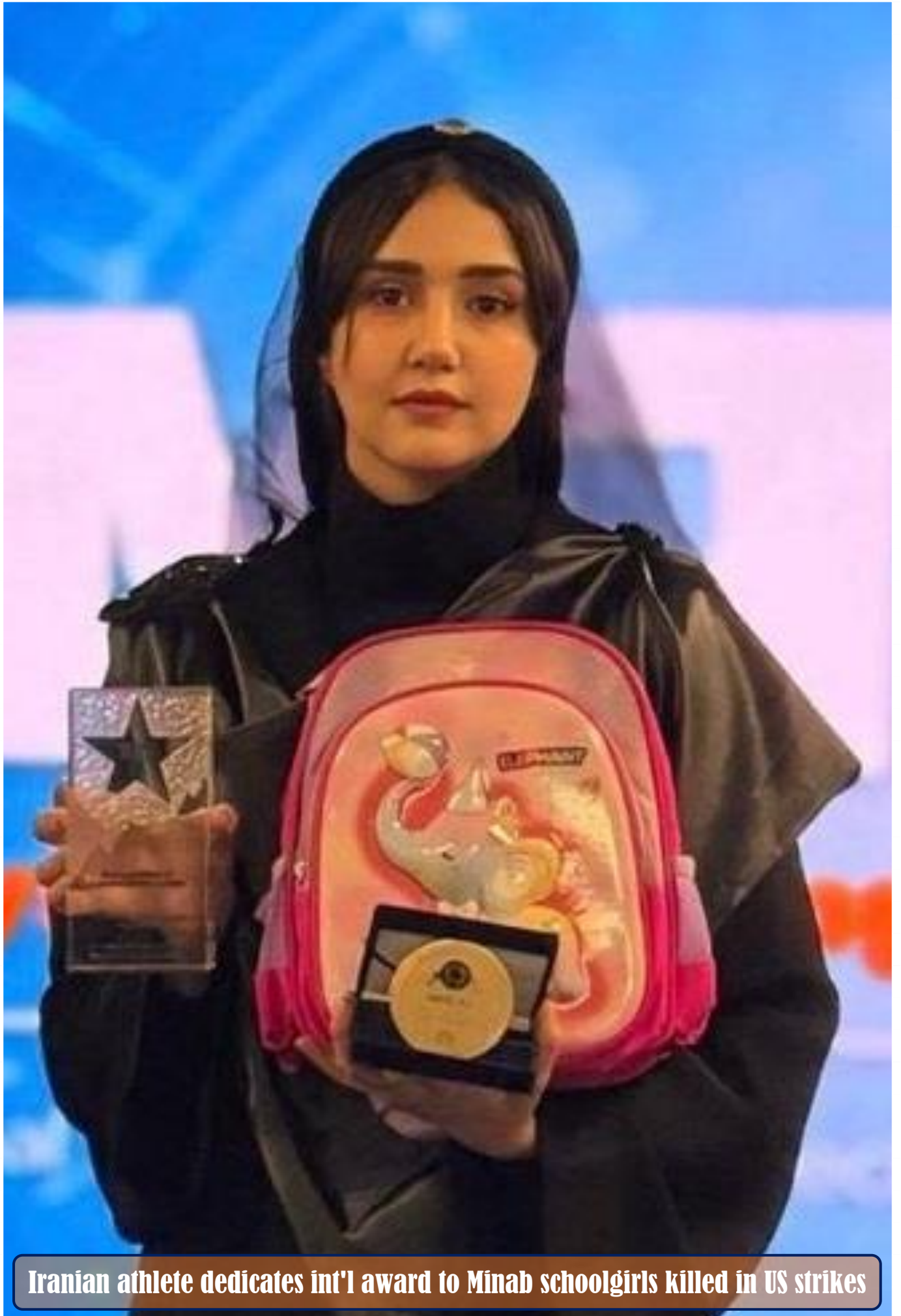
Iranian athlete dedicates int'l award to Minab schoolgirls killed in US strikes